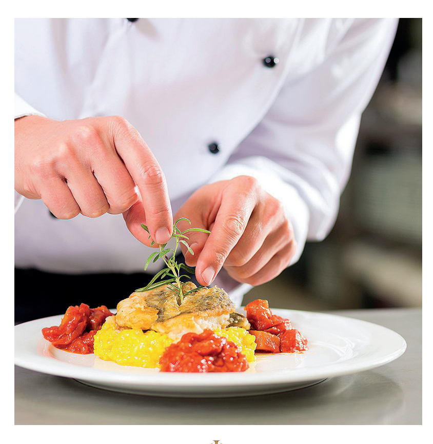
(1) Ehe place for sazing "i do"