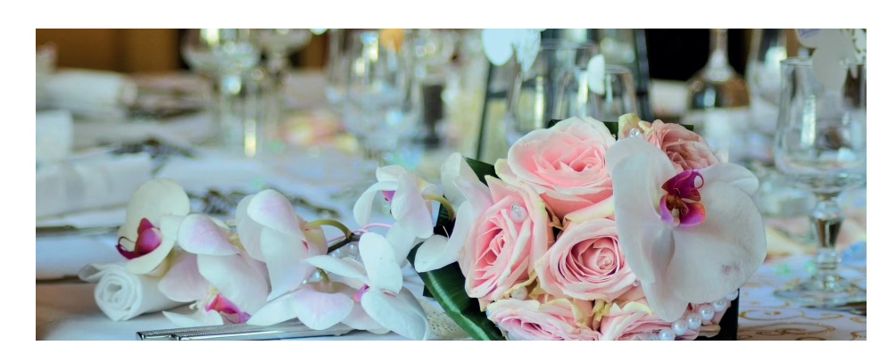
(1) Ehe place for saring "i do"

A wedding's setting is the aspect that the happy couple and their guests will remember more than anything else. Phi Hotels offer large, well-appointed spaces both indoors and outdoors, with elegant furnishings, personalized banquets, and a Wedding Suite for the bride and groom. Our chefs have always creatively blended local food and wine traditions with the most sophisticated and innovative international cuisine, creating a personalized menu capable of meeting your every need. The Phi Hotels staff, who are attentive in sensing and meeting your needs, ensure top-quality service.