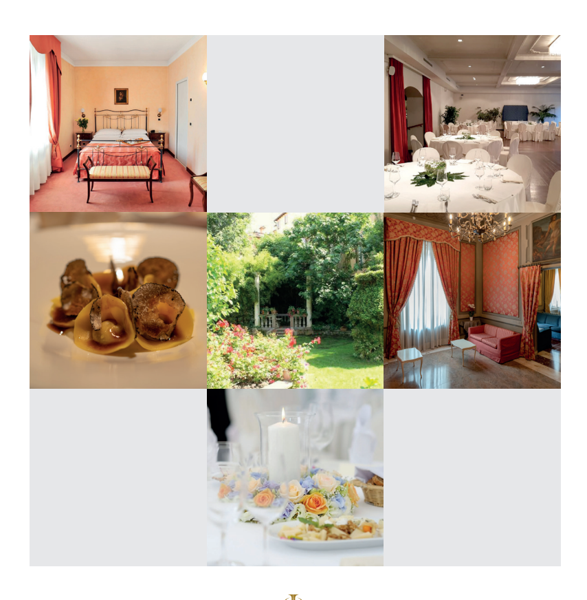
(1) Ehe place for saring "i do"